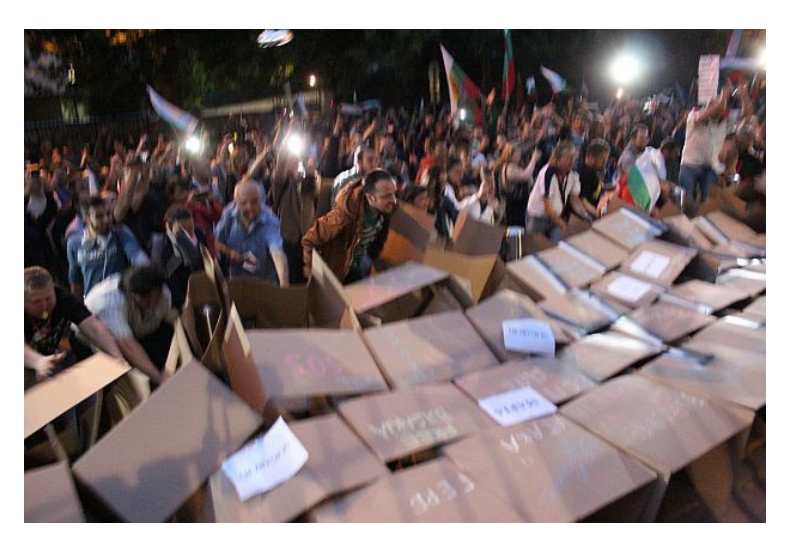
Figure 1. Protesters collapsing a Berlin Wall made of cardboard during anti-government demonstrations.

Keywords: Berlin Wall, Bulgaria, post-communism, recording surface, protest, transition, post-1989