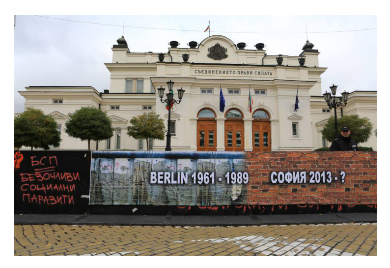
Figure 3. The fence three days after its metal bars were exchanged for panels.

In a similar process of simultaneous material heterogenization and discursive solidification, the crowd-control fence installed in front of Sofia's Parliament building during the abovementioned anti-government protests also underwent a peculiar material-semiotic transformation. After the fences made up of vertical metal bars were replaced by a smooth, continuous surface on November 12, 2013, passers-by and protesters quickly started attaching to it various materials in an attempt to articulate it as a "wall." Brick-patterned A4 sheets of paper, a poster reading "Berlin 1961 - 1989 / Sofia 2013 - ?" (Figure 3) and pieces of cardboard set on fire all contributed to the stabilization - and simultaneous "destruction" - of yet another reincarnation of the Berlin Wall in Bulgaria.